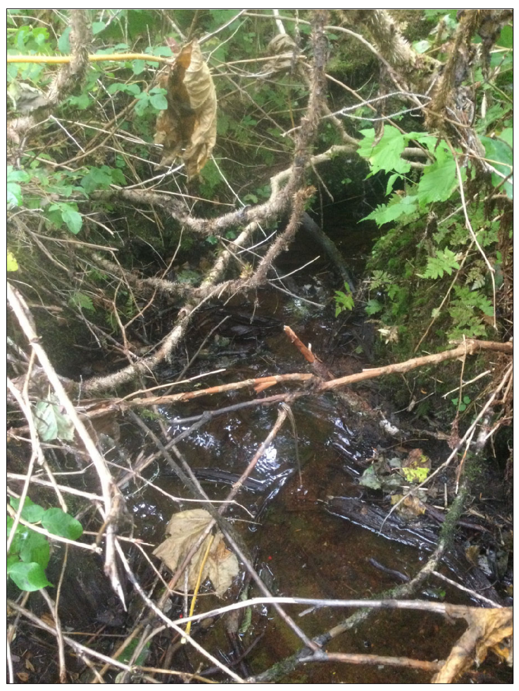
Figure 2.—Channel at waypoint 1802.