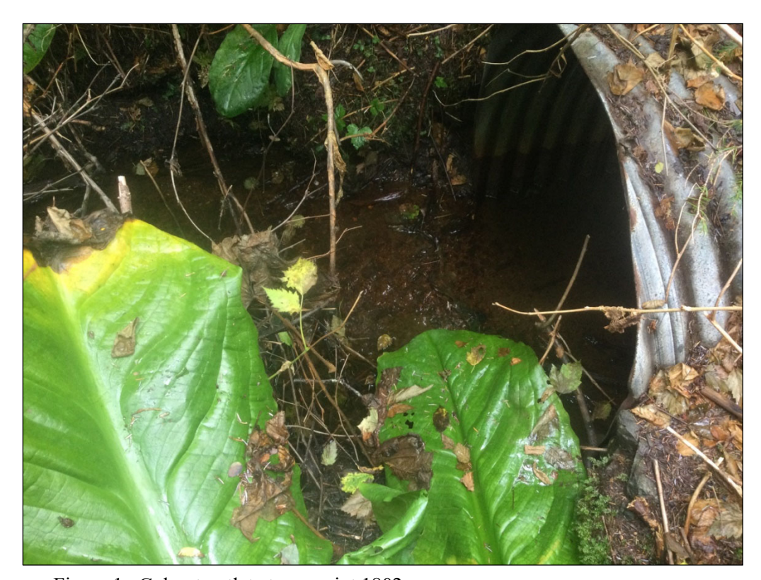
Figure 1.-Culvert outlet at waypoint 1802.